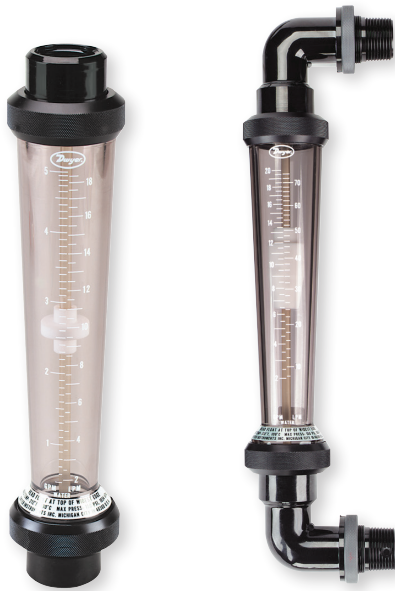
Shown with optional polysulfone fittings